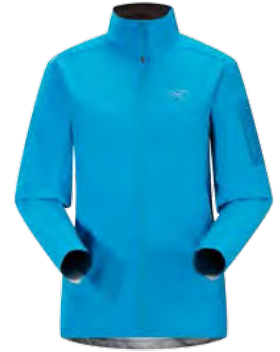
EPSILON LT JACKET

Moderate warmth mid layer jacket with the air permeability of a fleece and the durable woven face of a softshell