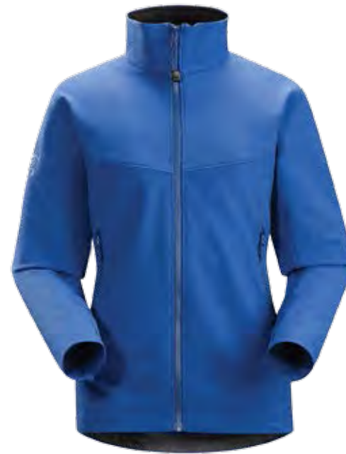
GAMMA LT JACKET