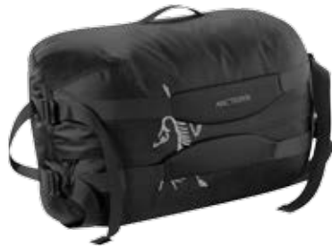
CARRIER DUFFLE 50

Lightweight, highly water resistant, mid-size 49L duffle bag with removable, adjustable webbing shoulder straps