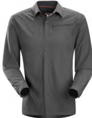
ADVENTUS COMP LS SHIRT

Super lightweight, quick-drying long-sleeved shirt that helps keep you cool and dry