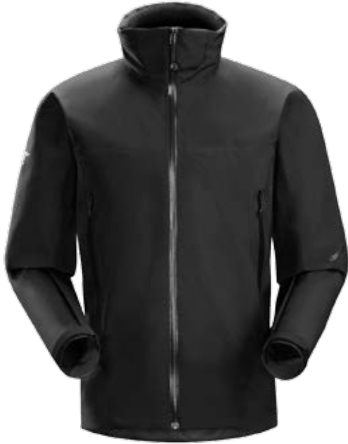
ZETA AR JACKET MEN'S

Clean styling with the technical performance power of GORE-TEX® fabric with 3L tricot backer: durable & good next-to-skin feel. The low profile, adjustable StowHood™ stows sleekly inside the collar