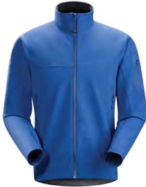
GAMMA LT JACKET