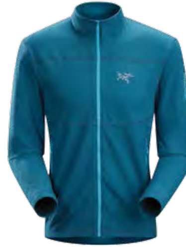
DELTA LT JACKET

Lightweight, breathable mid-layer fleece jacket