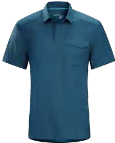
SKYLINE SS SHIRT

Super light, breathable short-sleeved shirt with a standard button collar, perfect for warm, summer days