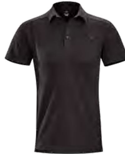
CAPTIVE POLO SS SHIRT

Relaxed-fitting, short-sleeved polo shirt made from light-weight, moisture-wicking cotton/polyester blend textile with spandex. Ideal for urban use or for more rugged pursuits