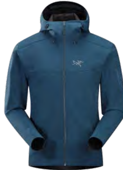
EPSILON LT HOODY

Moderate warmth mid layer hoody with good air permeability and the durable woven face of a softshell