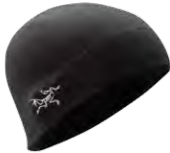
RHO LTW BEANIE

A Wool beanie, featuring a double layered headband and embroidered Bird logo on the side. This merino wool/spandex blend beanie has a double layered headband for added warmth and embroidered bird logo on the side