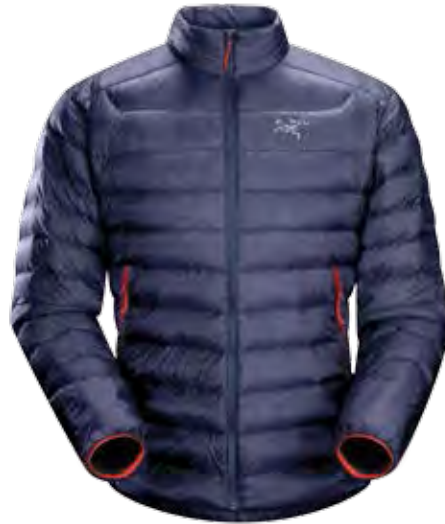
CERIUM LT JACKET

Streamlined, lightweight, down jacket filled with 850 white goose down. This backcountry jacket is intended as a mid layer or standalone piece in cool, dry conditions