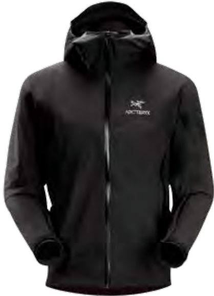
BETA SL JACKET

Super lightweight, packable waterproof GORE-TEX® PacLite® jacket designed for take-along emergency storm protection for hikers