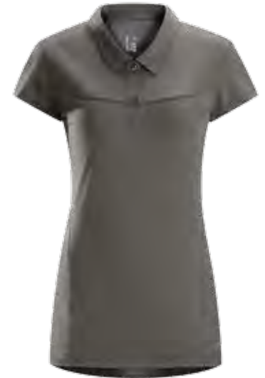
MOTIVE POLO SS SHIRT

Moisture-wicking polo shirt designed for indoor and outdoor activities