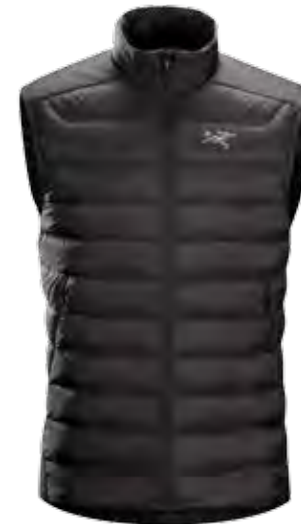
CERIUM LT VEST

Streamlined, lightweight, vest filled with 850 white goose down. This backcountry specialist is intended as a mid layer or standalone piece in cool, dry conditions