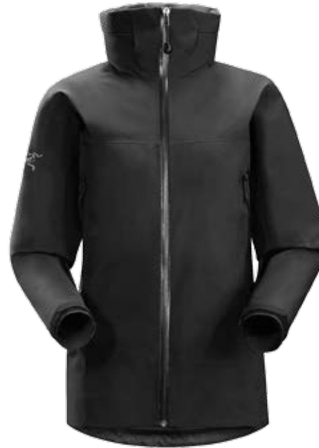
ZETA AR JACKET WOMEN'S

Clean styling with the technical performance power of GORE-TEX® fabric with 3L tricot backer: durable & good next-to-skin feel. The low profile, adjustable StowHood™ stows sleekly inside the collar