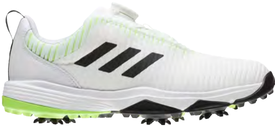
EF1219 ftwrwhite/coreblack/signalgrn Available 02/01/2020