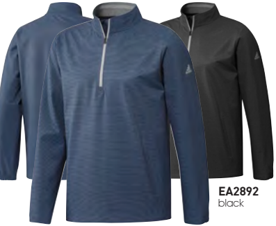
EA2889 collegiate navy