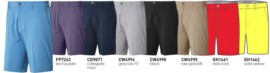
FP7262 light blue