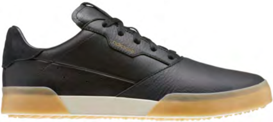
EE9163 Med coreblack/goldmet/cleabrown Available 02/01/2020