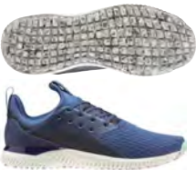
EF5618 Med tech indigo/silver met/ collegiate navy Available 02/01/2020