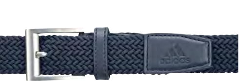
DT0104 collegiate navy