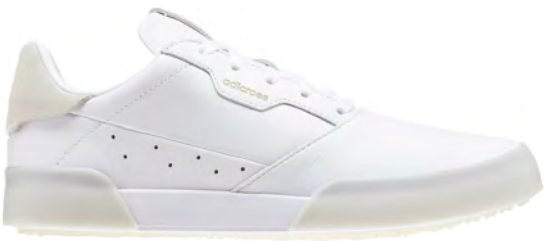
E69143 ftwrwhite/goldmet/crystwhite Available 02/01/2020