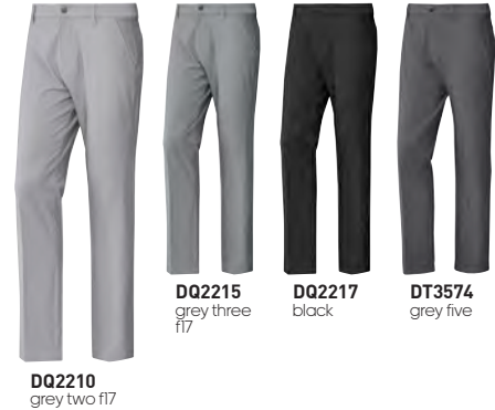
DQ2210 grey two f17

MSRP: $80 • Sizes: 28–44 • 55% Nylon / 34% Polyester / 11% Elastane Twill