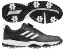
EF1220 coreblack/ftwrwhite/gloryblue Available 02/01/2020