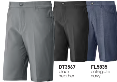
DQ2171 tmag grey three htr