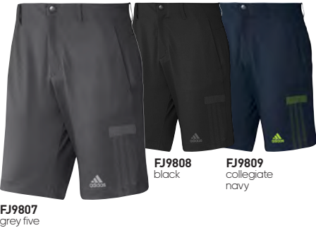
FJ9807 grey five