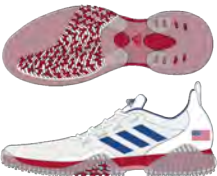
FU7491 Med ftwr white/tearoyblu/scarlet Available 06/01/2020/ SPECIAL EDITION