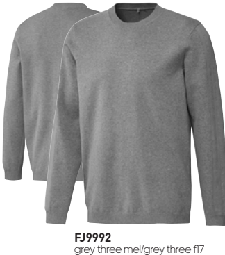
FJ9992 grey three mel/grey three fl7