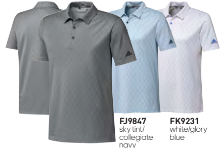
FQ0843 grey three f17/black