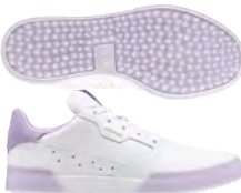
E69144 ftwrwhite/purpletint/ftwrwhite Available 02/01/2020