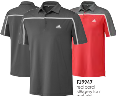
FJ9947 real coral sl8/grey four mel-sl8

MSRP: $65 • Sizes: S-2XL • 88% Recycled Polyester / 12% Elastane Single Jersey