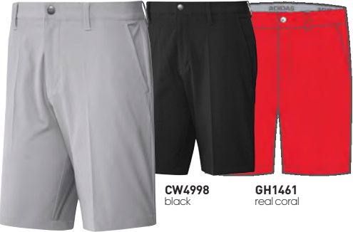
CW4994 grey two fl7

MSRP: $65 • Sizes: 30-42 • 88% Recycled Polyester / 12% Elastane Plain Weave