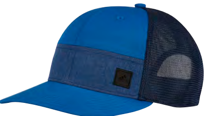
FQ2160 trace royal sl8