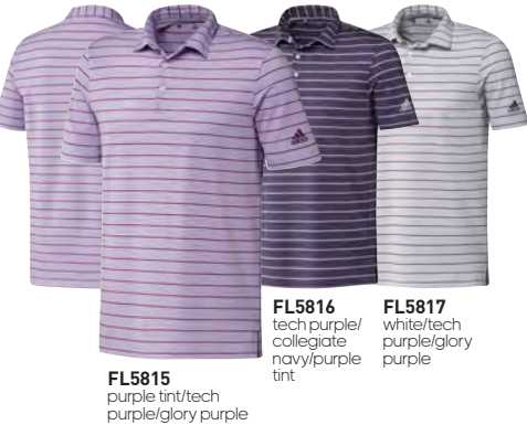
FL5815 purple tint/tech purple/glorious purple

MSRP: $65 • Sizes: S-2XL • 88% Polyester / 12% Elastane Single Jersey