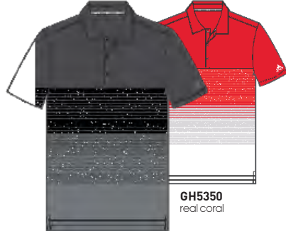
GH5350 real coral

MSRP: $75 • Sizes: S-2XL • 92% Polyester / 8% Elastane Single Jersey