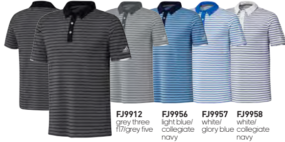
FJ9911 grey five/black