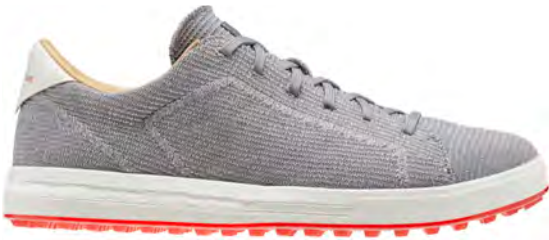
EE9194 Med/Wide greythree/silvermet/orbitgrey Available 02/01/2020