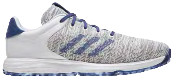
EF0688 Med ftwr white/tech indigo/grey two Available 12/01/2019