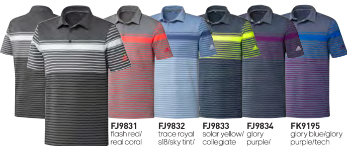
FJ9830 white/black/ black melange