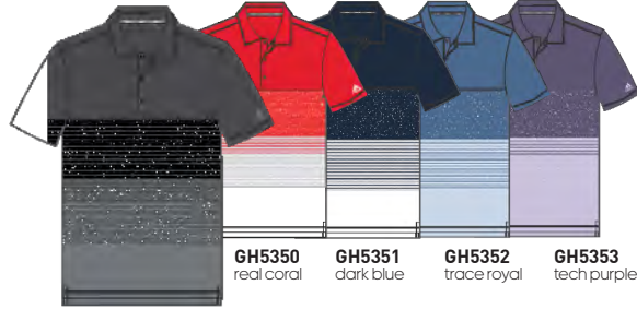
GH5350 real coral