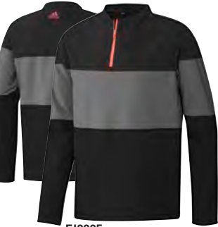
FJ9935 black/grey three fl7