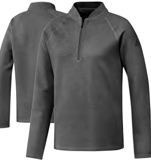
FI7222 black heather

MSRP: $75 • Sizes: S-2XL • 66% Cotton / 34% Recycled Polyester Spacer