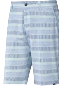
FJ9872 sky tint