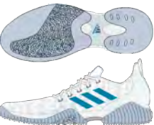
EG8984 Med ftwr white/sharpblue/bluspirit Available 03/01/2020 SPECIAL EDITION