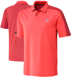
FJ9914 flash red/black

MSRP: $80 • Sizes: S-XL • 57% Recycled Polyester / 38% Polyester / 5% Elastane Jacquard