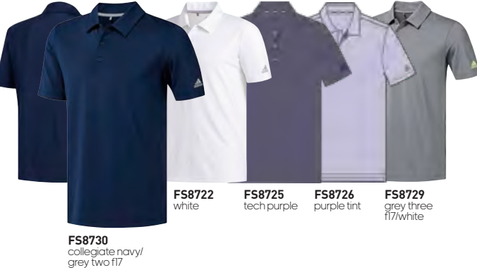
FS8730 collegiate navy/ grey two f17

MSRP: $65 • Sizes: S-3XL • 44% Polyester / 44% Recycled Polyester / 12% Elastane Single Jersey; Back Body And Sleeves: 88% Polyester / 12% Elastane Single Jersey