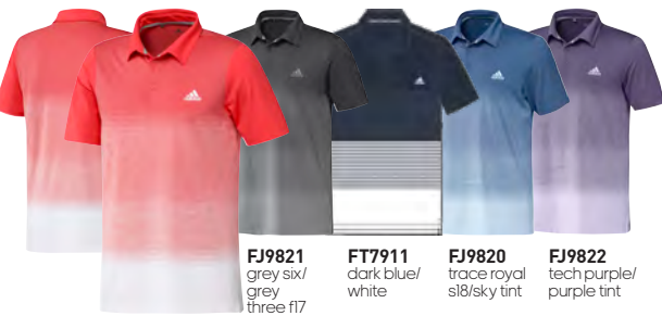
FQ2986 real coral sl8/white