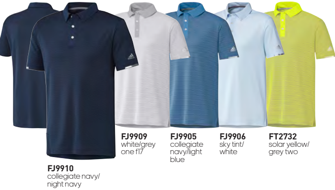
FJ9910 collegiate navy/ night navy

MSRP: $80 • Sizes: S-2XL • 74% Polyester / 26% Recycled Polyester Doubleknit