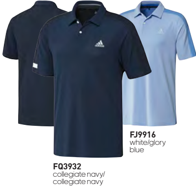
FQ3932 collegiate navy/ collegiate navy

MSRP: $80 • Sizes: S-XL • 57% Recycled Polyester / 38% Polyester / 5% Elastane Jacquard