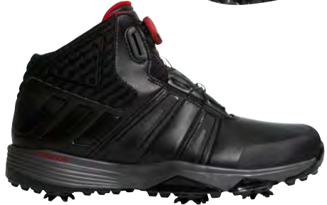
Q44894 Med/Wide core black/core black/core black Available Now