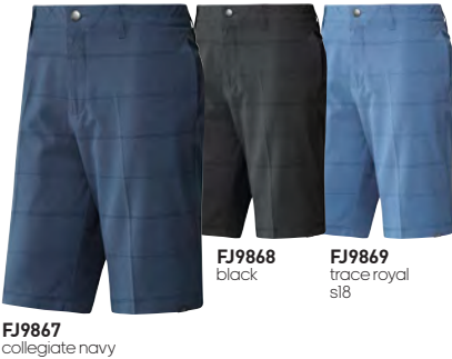
FJ9867 collegiate navy