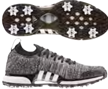
F35408 Med coreblack/ftwrwhite/silvermet Available 10/1/2019