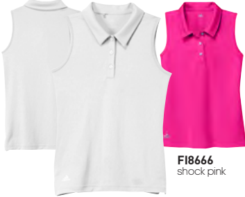
F18666 shock pink