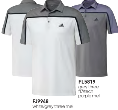
FJ9948 white/grey three mel

MSRP: $65 • Sizes: S-2XL • 88% Recycled Polyester / 12% Elastane Single Jersey