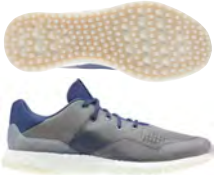
EE9132 Med metal grey/grey three/tech indigo Available 02/01/2020