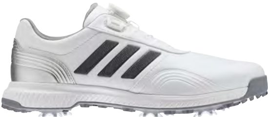
F34198 Med / BB7906 Wide ftwrwhite/greysix/silvermet Available Now