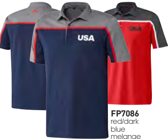
FP7086 red/dark blue melange