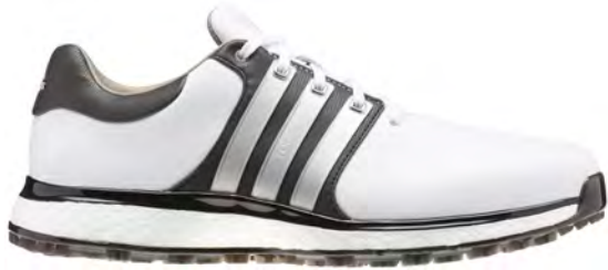
EE9179 Med / EE9190 Wide ftwrwhite/matsilver/coreblack Available 02/01/2020