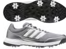
EE9123 Med / EE9420 Wide iron met/ftwr white/scarlet Available 02/01/2020