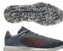
EF0690 Med grey three/collegiate burgundy/ grey five Available 12/01/2019