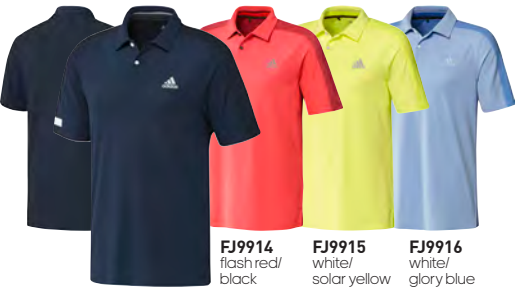
FQ3932 collegiate navy/collegiate navy