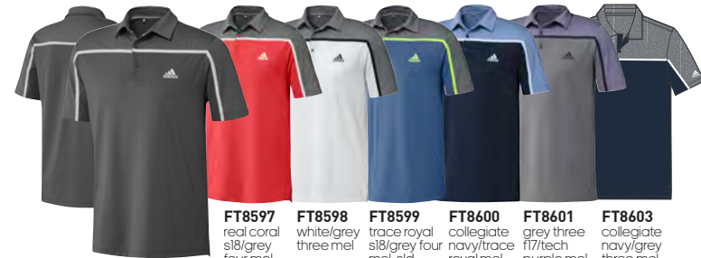
FT8597 real coral sl8/grey four mel- sld