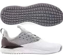
F35409 Med ftwrwhite/silvermet/greytwo Available Now