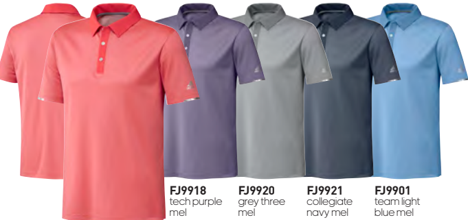
FJ9900 real coral mel