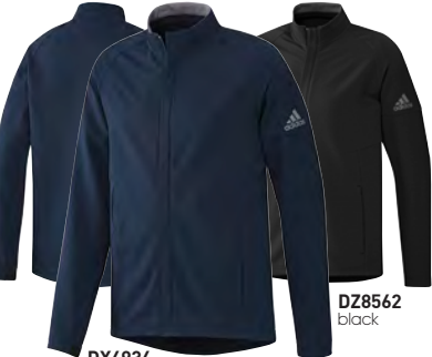
DX4934 collegiate navy