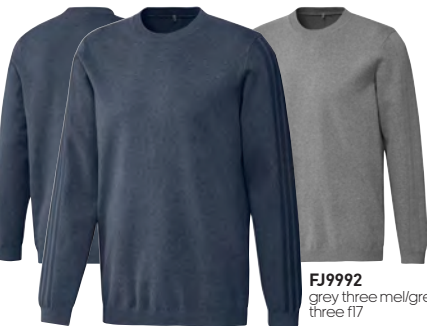
FJ9991 collegiate navy mel/collegiate navy