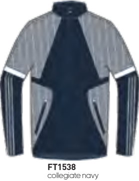
FT1538 collegiate navy

MSRP: $150 • Sizes: S-XL • Regular fit is wider at the body, with a straight silhouette • Stand-up collar • Long sleeves • 62% recycled polyester / 38% polyester engineered • Front zip pockets; 1/2 zip