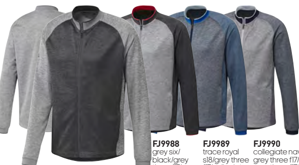
FJ9969 grey three fl7/grey two fl7/grey six/ black