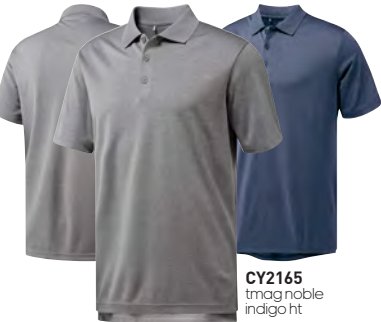
CY2164 tmag grey three htr