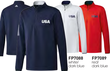
FP7088 white/ dark blue FP7089 red/ dark blue