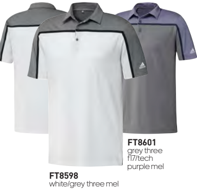
FT8598 white/grey three mel

MSRP: $65 • Sizes: S-2XL • 88% Recycled Polyester / 12% Elastane Single Jersey