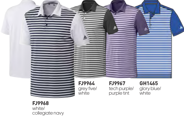
FJ9968 white/ collegiate navy

MSRP: $65 • Sizes: S-2XL • Front Body: 44% Polyester / 44% Recycled Polyester / 12% Elastane Single Jersey; Back Body And Sleeves: 88% Polyester / 12% Elastane Single Jersey Front Body: