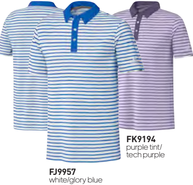
FJ9957 white/glorious blue

MSRP: $80 • Sizes: S-2XL • 74% Polyester / 26% Recycled Polyester Doubleknit