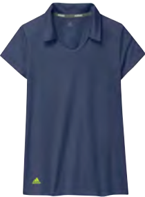
F18678 tech indigo