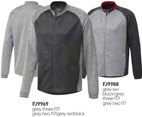
FJ9969 grey three fl7/ grey two fl7/grey six/black

MSRP: $90 • Sizes: S-2XL • 67% Recycled Polyester / 33% Polyester Doubleknit