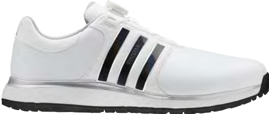
F34188 Med/Wide ftwrwhite/core black/silvermet Available Now