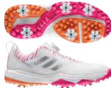
EF1221 ftwrwhite/shockpink/ambertint Available 02/01/2020