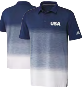
FJ7887 dark blue