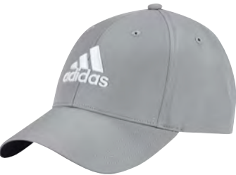
FI3093 grey three fl7

MSRP: $20 • Sizes: OSFM • 100% Polyester Dobby