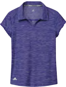
F18682 night flash