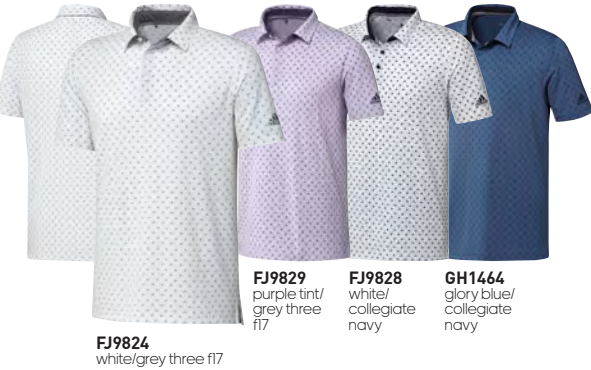
FJ9824 white/grey three f17

MSRP: $65 • Sizes: S-2XL • 88% Recycled Polyester / 12% Elastane Single Jersey