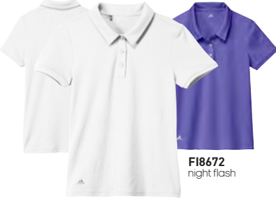
F18672 night flash