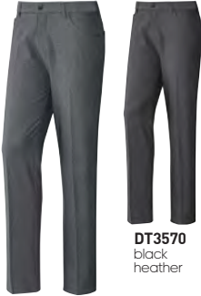
DT3570 black heather

MSRP: $90 • Sizes: 30-42 • 55% nylon / 34% polyester / 11% elastane twill