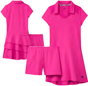
F18669 shock pink