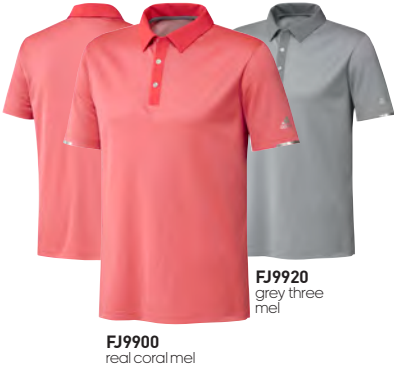
FJ9900 real coral mel

MSRP: $75 • Sizes: S-3XL • 73% Polyester / 27% Recycled Polyester Doubleknit