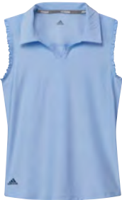
F18657 glow blue