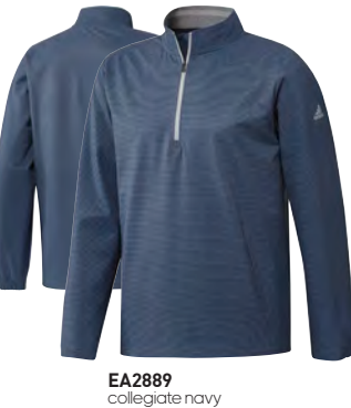
EA2889 collegiate navy

MSRP: $90 • Sizes: S-2XL • 47% Polyester / 43% Recycled Polyester / 10% Elastane Plain Weave