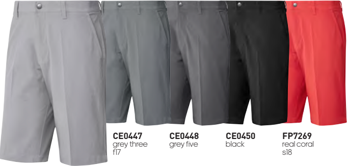
CD9875 grey two fl7

MSRP: $65 • Sizes: 28-44 • 88% Recycled Polyester / 12% Elastane Plain Weave • 10.5" inseam