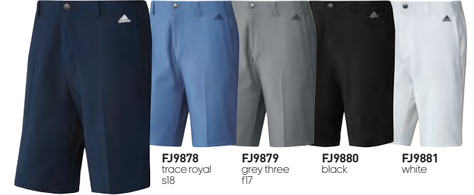
FJ9877 collegiate navy