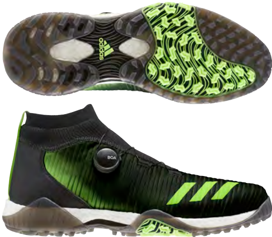
EE9105 Med coreblack/signalgrn/dghsolgre Available 02/01/2020