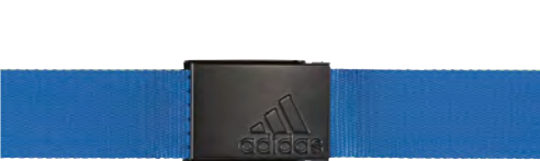
FJ1090 trace royal sl8