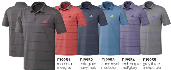
FJ9951 real coral mel/grey three f17/ black