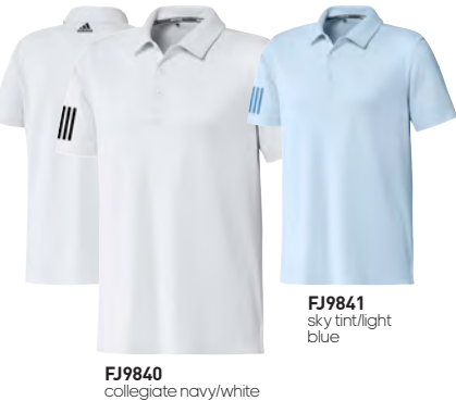
FJ9840 collegiate navy/white

MSRP: $60 • Sizes: S-2XL • 100% Recycled Polyester Piqué