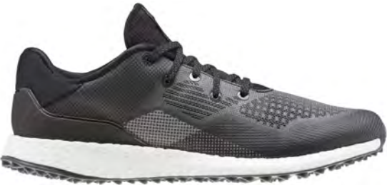
EE9130 Med core black/ftwr white/grey five Available 02/01/2020