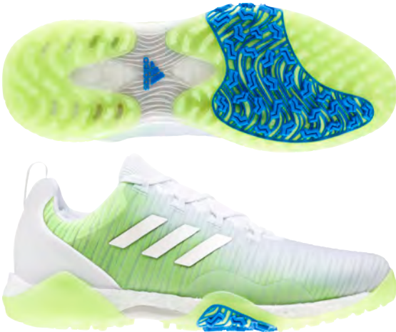
EE9101 Med ftwr white/core black/signal green Available 02/01/2020