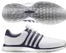
BB7914 Med / F34991 Wide ftwrwhite/collenavy/goldmet Available Now