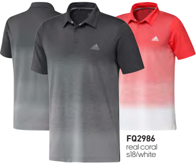
FQ2986 real coral sl8/white

MSRP: $75 • Sizes: S-2XL • 92% Polyester / 8% Elastane Single Jersey