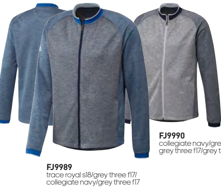
FJ9989 trace royal sl8/grey three f17/ collegiate navy/grey three f17

MSRP: $90 • Sizes: S-2XL • 67% Recycled Polyester / 33% Polyester Doubleknit