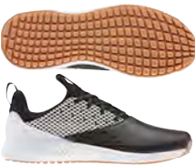
G26009 Med coreblack/dksilvmet/ftwrwhite Available Now