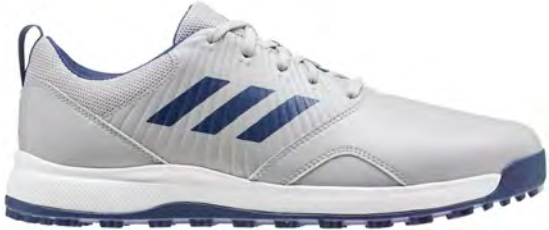
EE9206 Med / EE9202 Wide greytwo/tecindigo/ftwrwhite Available 02/01/2020