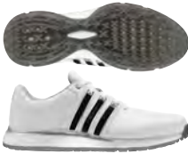
BB7913 Med / F34990 Wide ftwrwhite/coreblack/silvermet Available Now