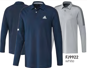
FJ9924 collegiate navy