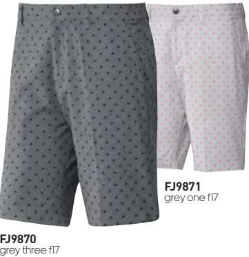
FJ9870 grey three f17

MSRP: $70 • Sizes: 30–42 • 88% Recycled Polyester / 12% Elastane Plain Weave • 9" inseam