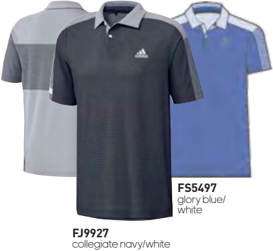
FJ9927 collegiate navy/white

MSRP: $80 • Sizes: S-XL • 57% Recycled Polyester / 38% Polyester / 5% Elastane Jacquard