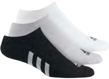
DM6092 black/grey two/white