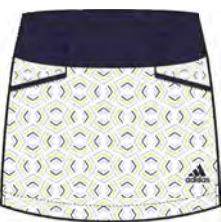
GD9480 tech indigo