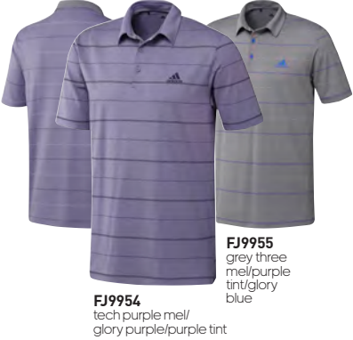
FJ9954 tech purple mel/ glory purple/purple tint

MSRP: $65 • Sizes: S-2XL • 88% Polyester / 12% Elastane Single Jersey