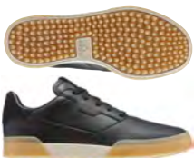
E69145 coreblack/goldmet/savannah Available 02/01/2020