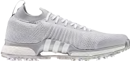
F35405 Med greytwo/ftwrwhite/silvermet Available 10/1/2019