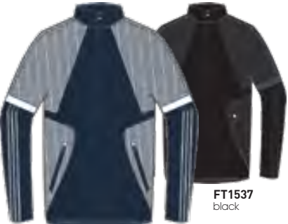
FT1538 collegiate navy