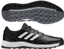
BD7138 Med / F34994 Wide black/white/silver met Available Now