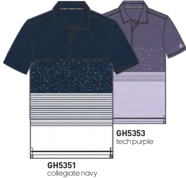
GH5351 collegiate navy

MSRP: $75 • Sizes: S-2XL • 92% Polyester / 8% Elastane Single Jersey