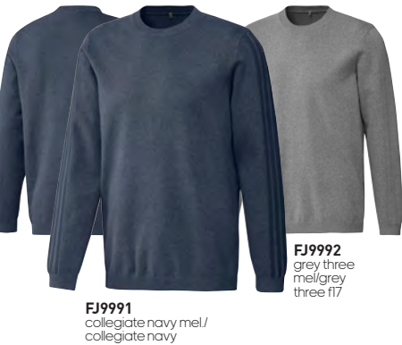
FJ9991 collegiate navy mel/ collegiate navy