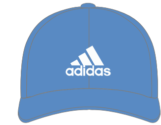
FS6797 light blue