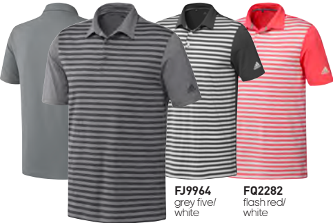
FJ9964 grey five/ white

MSRP: $65 • Sizes: S-2XL • Front Body: 44% Polyester / 44% Recycled Polyester / 12% Elastane Single Jersey; Back Body And Sleeves: 88% Polyester / 12% Elastane Single Jersey Front Body: