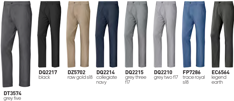
DT3574 grey five