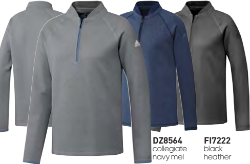
DZ8563 tmag grey three htr