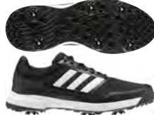
EE9122 Med / EE9419 Wide coreblack/ftwr white/core black Available 02/01/2020