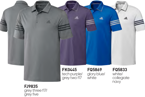
FJ9835 grey three f17/ grey five

MSRP: $65 • Sizes: S-2XL • 88% Recycled Polyester / 12% Elastane Single Jersey