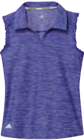
F18658 night flash