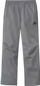
FI8662 grey three