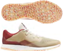
EF5746 Med chaliwhite/cburgundy/savannah Available 02/01/2020