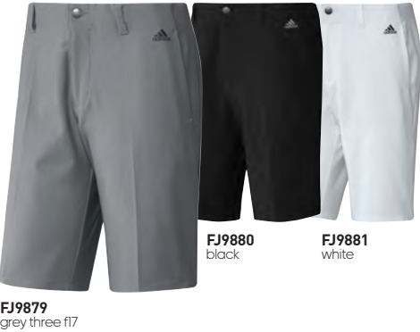
FJ9879 grey three f17

MSRP: $65 • Sizes: 30–42 • 55% Nylon / 34% Polyester / 11% Elastane Twill • 10.5" inseam