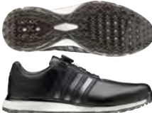
F34191 Med/Wide coreblack/ironmet/silvermet Available Now