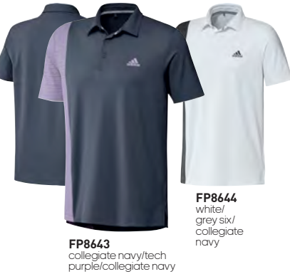
FP8643 collegiate navy/tech purple/collegiate navy

MSRP: $65 • Sizes: S-2XL • 88% Recycled Polyester / 12% Elastane Single Jersey