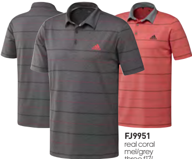
FJ9951 real coral mel/grey three fl7/ black

MSRP: $65 • Sizes: S-2XL • 88% Polyester / 12% Elastane Single Jersey