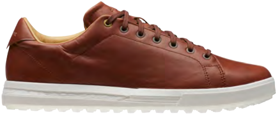
EF8395 Med/Wide tanbrown/goldmet/corewhite Available 02/01/2020