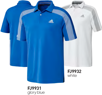
FJ9931 glory blue

MSRP: $90 • Sizes: S-XL • 100% Recycled Polyester Doubleknit