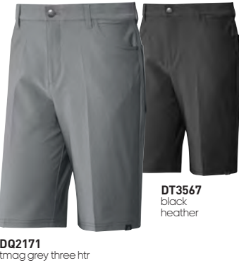
DQ2171 tmag grey three htr

MSRP: $70 • Sizes: 30–42 • 88% Recycled Polyester / 12% Elastane Plain Weave