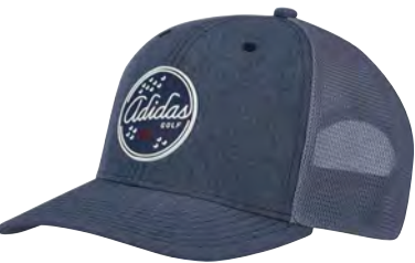
FI3118 collegiate navy mel.