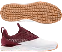
F35410 Med ftwrwhite/cburgundy/gum Available Now