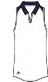
GD9481 tech indigo