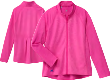
F18686 shock pink mel