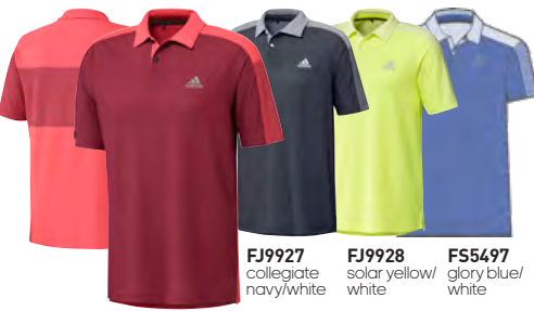
FJ9926 black/flash red