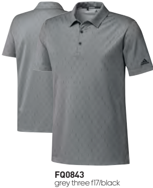
FQ0843 grey three fl7/black

MSRP: $65 • Sizes: S-2XL • 100% recycled polyester piqué