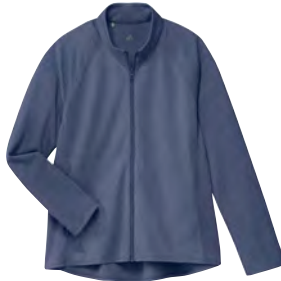
F18685 tech indigo mel