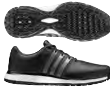
BB7916 Med / F34993 Wide coreblack/ironmet/ftwrwhite Available Now