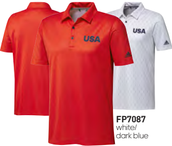
FP7087 white/ dark blue