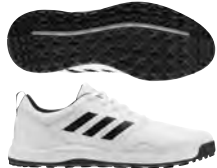
BB7900 Med / F34996 Wide ftwrwhite/coreblack/greysix Available Now