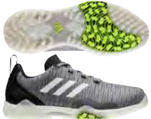
EE9103 Med grey three/ftwr white/signal green Available 02/01/2020