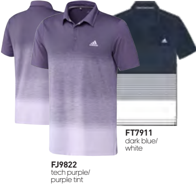
FJ9822 tech purple/ purple tint

MSRP: $75 • Sizes: S-2XL • 92% Polyester / 8% Elastane Single Jersey