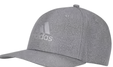
FI3160 grey two fl7