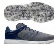
EF0691 Med tech indigo/collegiate navy/ grey three Available 12/01/2019