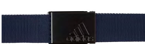
FI3015 collegiate navy

MSRP: $20 • Sizes: OSFM • 100% Polyester Tape