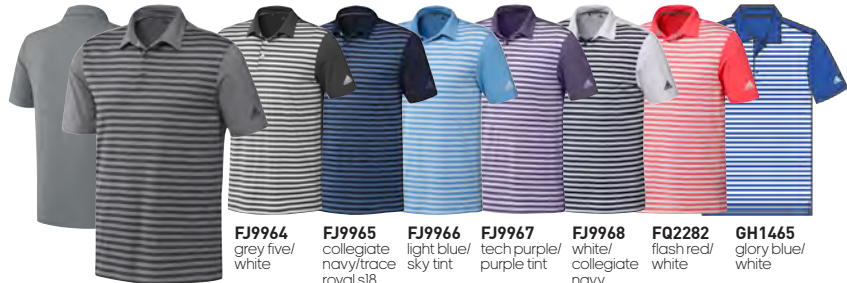
FJ9964 grey five/ white