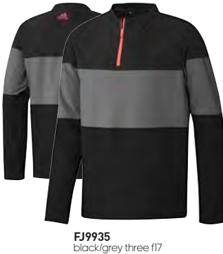
FJ9935 black/grey three fl7

MSRP: $90 • Sizes: S-2XL • Upper Part: 80% Recycled Polyester / 20% Elastane Engineered; Lower Part: 88% Recycled Polyester / 12% Elastane Plain Weave