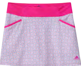
F18668 shock pink