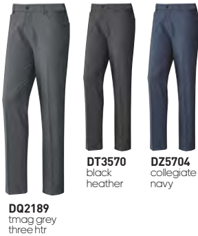
DQ2189 tmag grey three htr