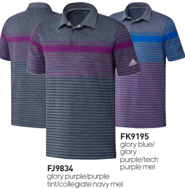
FJ9834 glory purple/purple tint/collegiate navy mel.

MSRP: $75 • Sizes: S-2XL • 88% Polyester / 12% Elastane Single Jersey