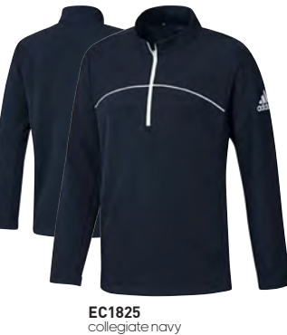
EC1825 collegiate navy

MSRP: $90 • Sizes: S-2XL • Upper part: 55% nylon / 34% polyester / 11% elastane twill; Lower part: 100% recycled polyester doubleknit