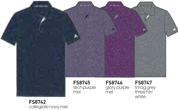
FS8742 collegiate navy mel.

MSRP: $65 • Sizes: S-2XL • 88% Polyester / 12% Elastane Single Jersey