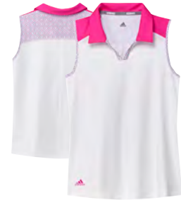
F18680 shock pink