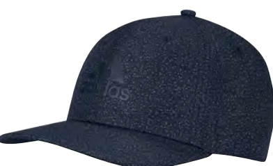
FI3159 collegiate navy

MSRP: $25 • Sizes: OSFM • 100% Polyester Ripstop