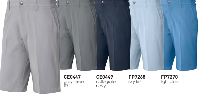
CD9875 grey two fl7