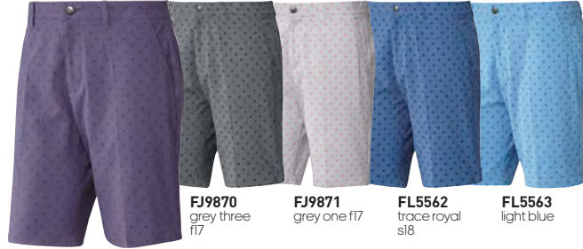
FL5565 tech purple