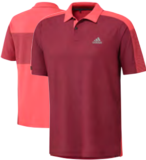
FJ9926 black/flash red

MSRP: $80 • Sizes: S-XL • 57% Recycled Polyester / 38% Polyester / 5% Elastane Jacquard