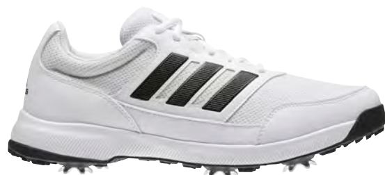
EE9121 Med / EE9418 Wide ftwr white/core black/ftwr white Available 02/01/2020