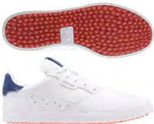
EE9164 Med ftwr white/silver met/tech indigo Available 02/01/2020