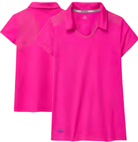
F18660 shock pink