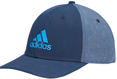
DX0602 collegiate navy