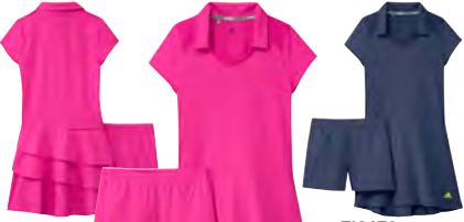
FI8670 tech indigo