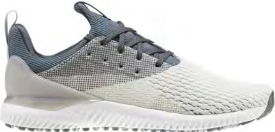
EE9159 Med orbit grey/silver met/grey six Available 02/01/2020