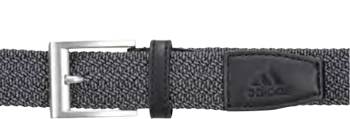
DP7429 grey three fl7

MSRP: $40 • Sizes: S/M,L/XL • 100% Coated Polyurethane