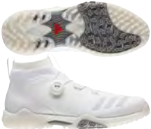
EE9106 Med ftwr white/ftwr white/grey three Available 02/01/2020