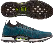
F35407 Med coreblack/actived/solaslime Available 10/1/2019