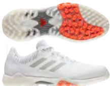
EE9102 Med ftwr white/metal grey/lgh solid grey Available 02/01/2020