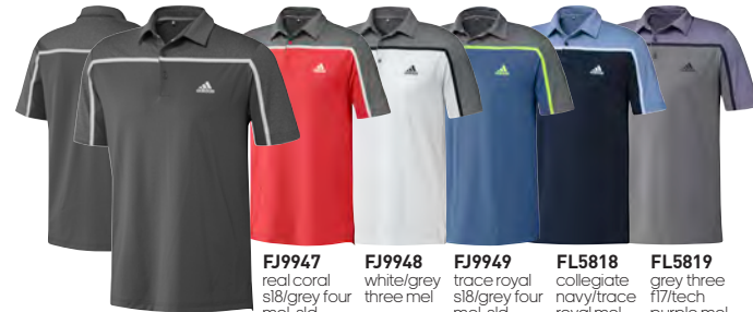
FJ9947 real coral sl8/grey four mel-sld