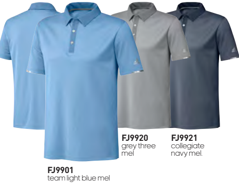
FJ9901 team light blue mel

MSRP: $75 • Sizes: S-3XL • 73% Polyester / 27% Recycled Polyester Doubleknit