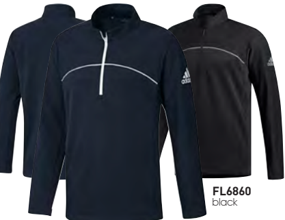
EC1825 collegiate navy