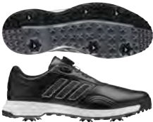
F34199 Med / BD7140 Wide coreblack/ftwrwhite/silvermet Available Now