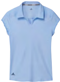
F18681 glow blue