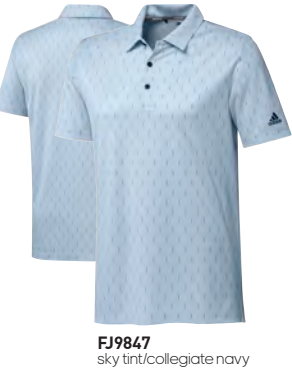
FJ9847 sky tint/collegiate navy

MSRP: $65 • Sizes: S-2XL • 100% recycled polyester piqué