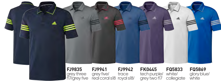
FJ9835 grey three f17/grey five