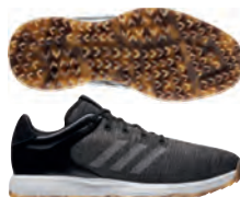
EF0689 Med coreblack/grey three/grey five Available 12/01/2019