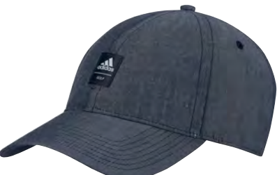
DT2184 collegiate navy

MSRP: $40 • Sizes: S/M,L/XL • 100% Coated Polyurethane