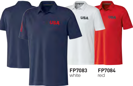
FP7083 white FP7084 red