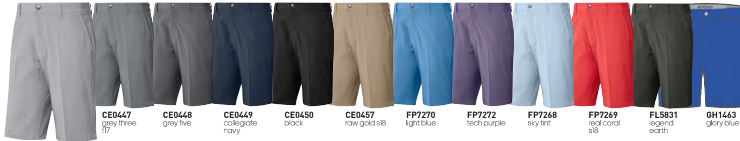
CD9875 grey two fl7