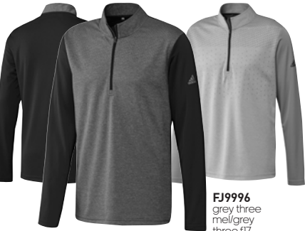
FJ9977 black heather/black

MSRP: $65 • Sizes: S-2XL • 100% Recycled Polyester Piqué