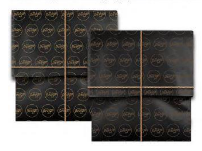
Reusable Hemp Paper Bundle

Apparel items are bundled using recycled hemp paper and hemp cord to create a unique and branded gifting experience for the end user.