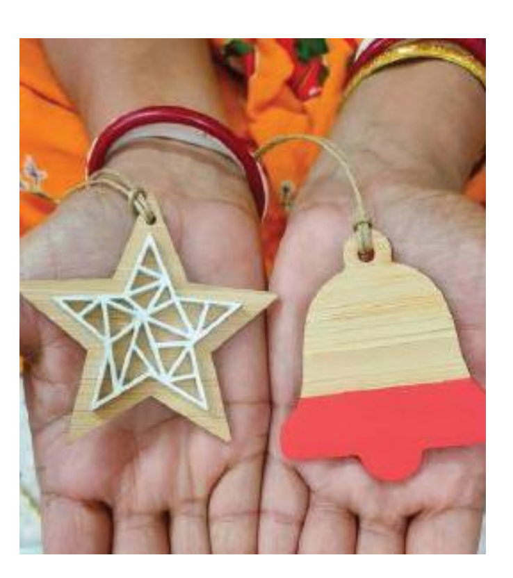
Fairtrade Bamboo Hangtag

Thank you for being a Patagonia customer and advocate, and please reach out to discuss other ideas for bringing Patagonia items to your team. But most of all, thank you for understanding, and giving a damn about saving our home planet.