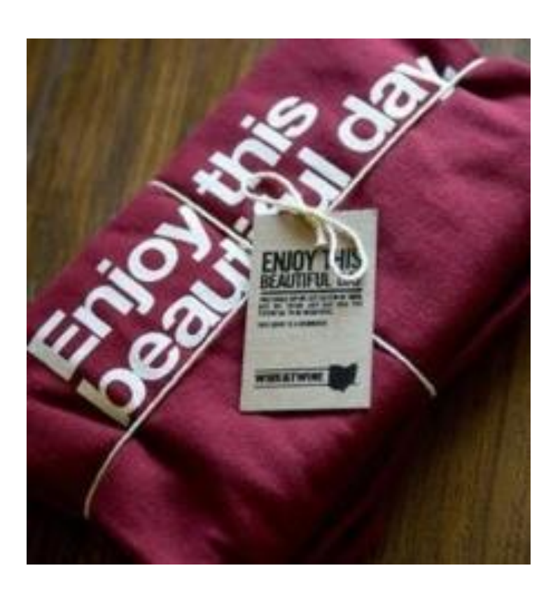
Organic Fiber String Bundle