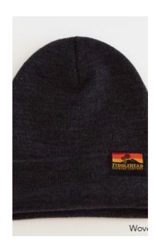
Recyclable Woven Label

Each day at Patagonia, we look for ways to use our business to save our home planet. As a clothier, that starts with creating goods that last—if not forever, then for a really, really long time. Using a garment for just over two additional years, for example, cuts its overall footprint by 82 percent, and we build our gear to be used for decades.