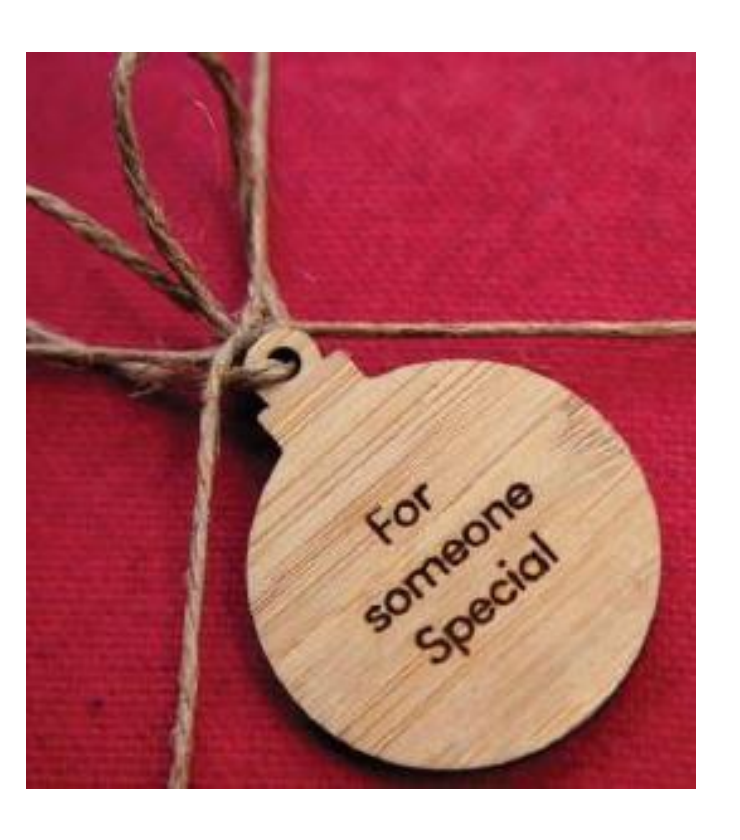
Fairtrade Bamboo Hangtag