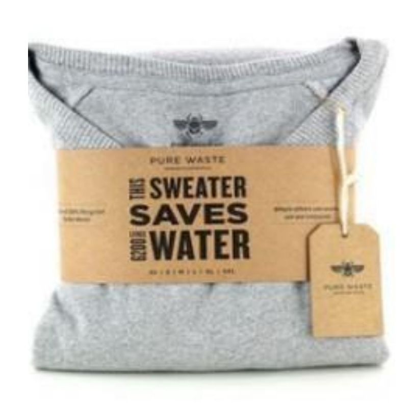
Recycled Craft Paper Sleeve