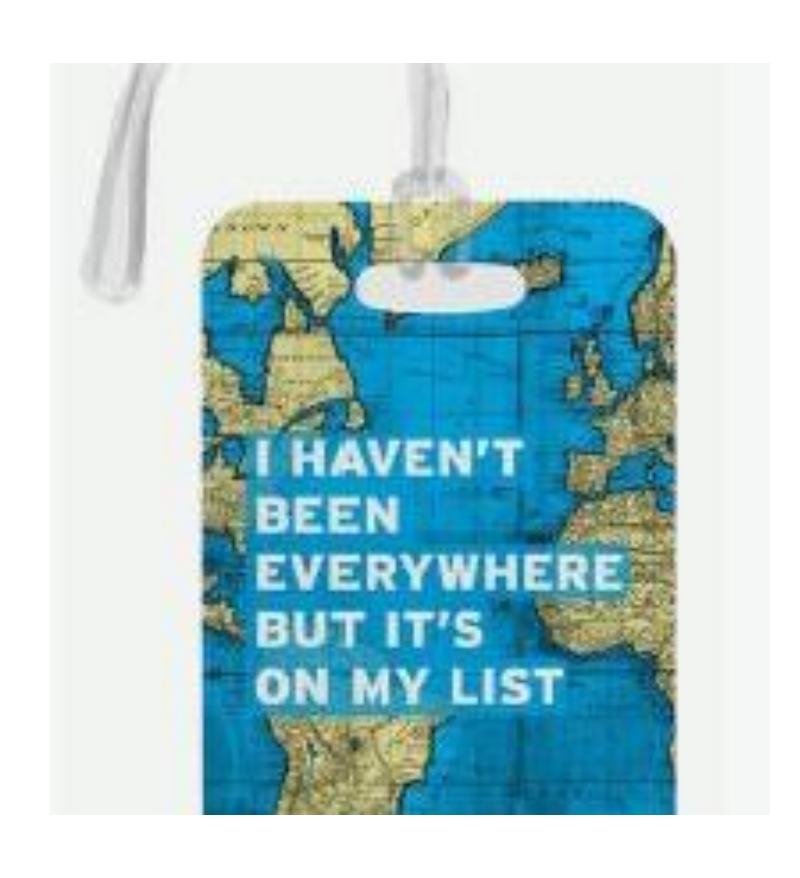
Recycled Luggage Tag