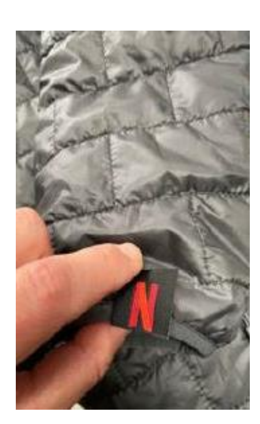
Recyclable Woven Label

Custom woven labels can be easily removed from garments without damaging the fabric