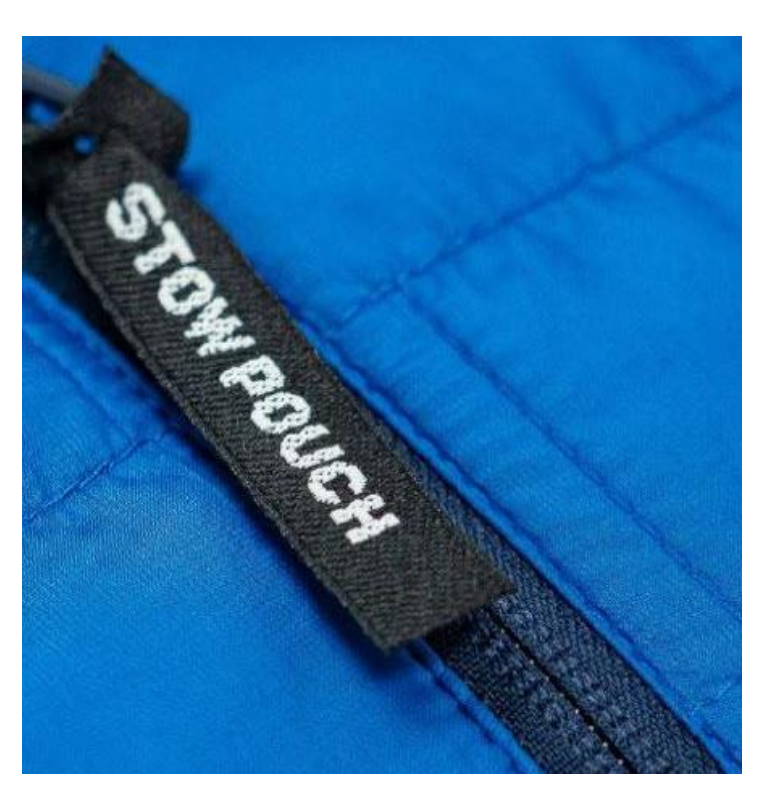
Recyclable Woven Zipper Pull

Custom zipper pulls add a recyclable and fully removable branding element