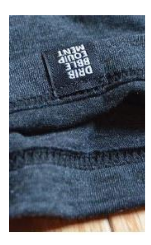
Recyclable Woven Label

Custom woven labels can be easily removed from garments without damaging the fabric