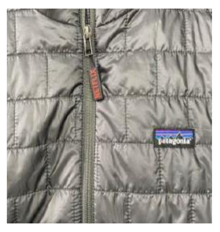
Recyclable Woven Zipper Pull

Custom zipper pulls add a recyclable and fully removable branding element