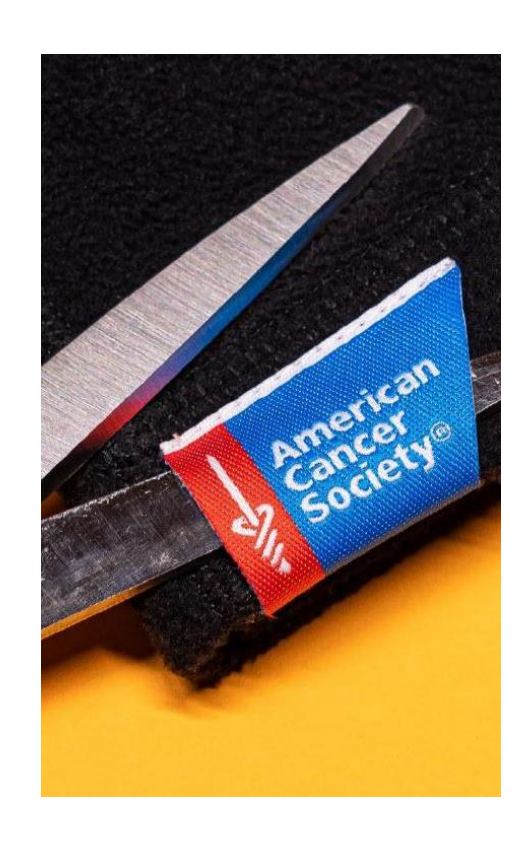
Recyclable Woven Label

Custom woven labels can be easily removed from garments without damaging the fabric