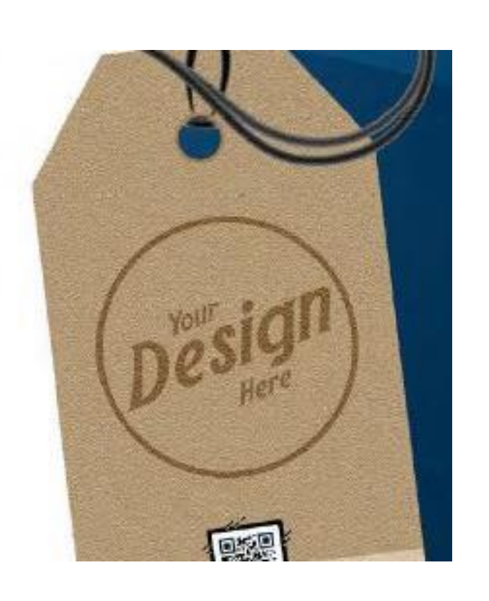
Recycled Paper Hangtag with QR