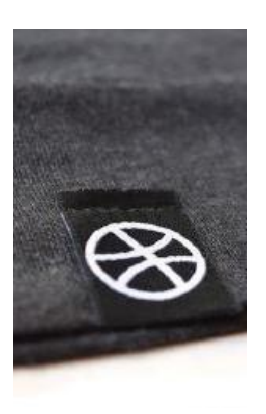
Recyclable Woven Label

Custom woven labels can be easily removed from garments without damaging the fabric