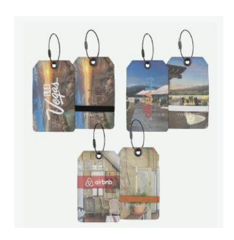
Recycled Felt Luggage Tag

When we made this decision, we accepted that it might cost us some business. But we hope you'll see this shift for what it is: another of our ongoing efforts to support a healthy planet—and a call to action. By joining us in extending the life of the gear you wear and use, you're making a statement about your own commitment to sustainability.