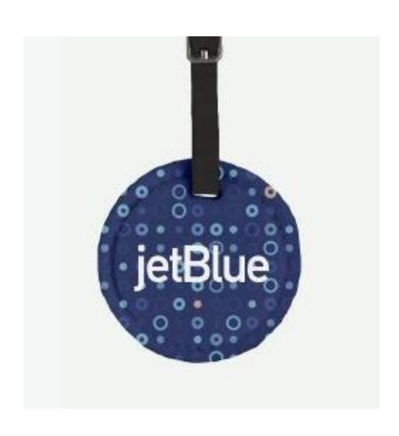
Recycled Felt Luggage Tag