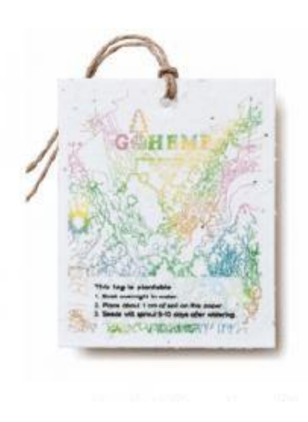
Seeded Paper Hangtag